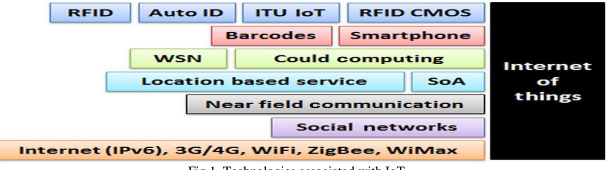
Fig.1. Technologies associated with IoT.

A wireless sensor network consists of a large number of premise of a WSN is to perform networked sensing using wireless-capable sensor devices working collaboratively to a large number of relatively unsophisticated sensors achieve a common objective. A WSN has one or more instead of the conventional approach of developing a few sinks (or base-station) which collect data from all sensor expensive and sophisticated sensing modules [10].